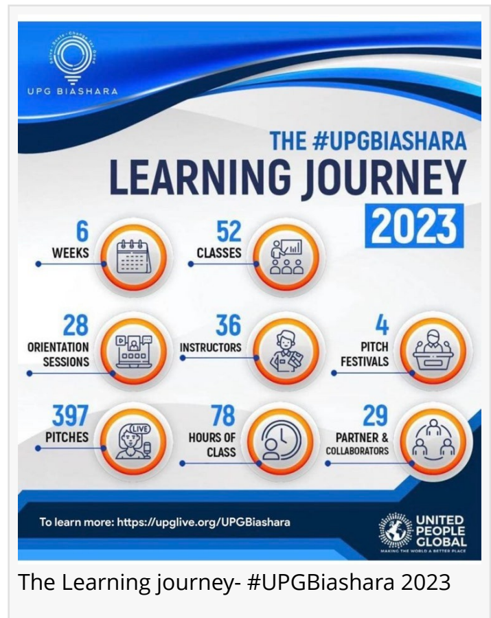
The Learning journey- #UPGBiashara 2023