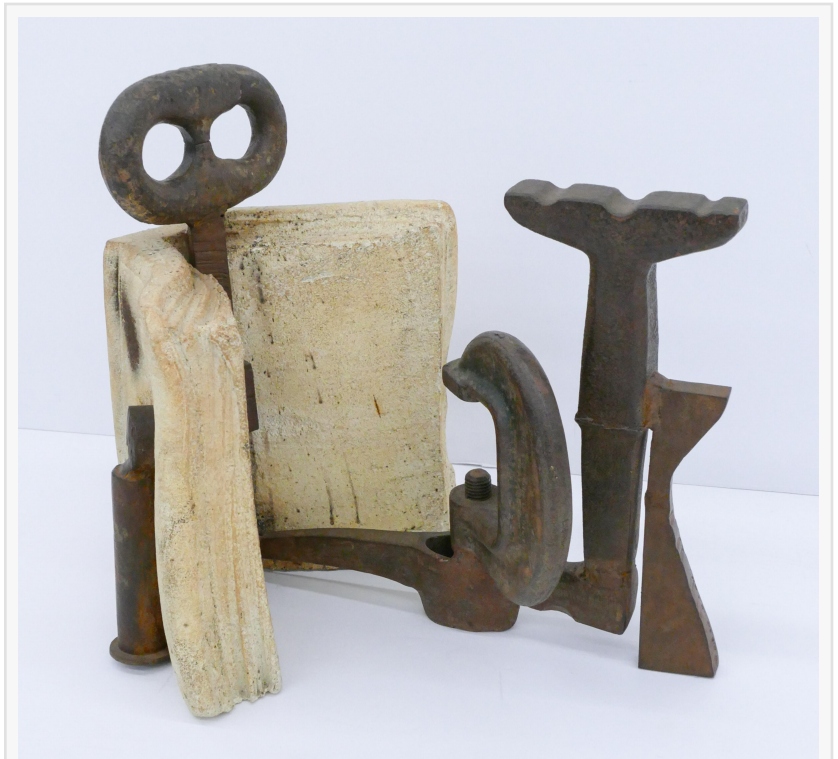
Two sculptures by Anthony Caro (British, 1924-2013) include this welded steel and stoneware sculpture from the 1970s titled Story Book , in overall excellent condition (est. $15,000-$25,000).