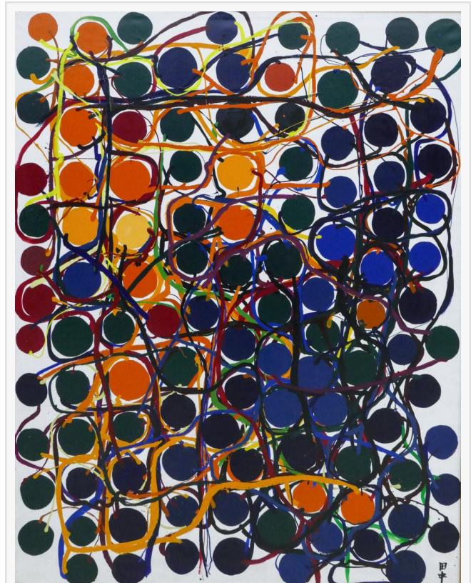
Important untitled synthetic polymer on canvas painting by the Japanese modernist Atsuko Tanaka (1932-2005), 64 ½ inches by 51 inches (canvas, less frame) (est. $300,000-$600,000).

The vibrant, colorful modernist work, measuring a stout 64 ½ inches by 51 inches (canvas, less frame), originally came out of a private estate in the Dakota Building in New York City. Tanaka