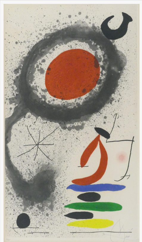
This 1969 etching with aquatint on wove paper by Joan Miro (Spanish, 1893-1983), titled Soleil Ebouillante (Dupin 518), is expected to change hands for $8,000-$12,000.

This press release can be viewed online at: https://www.einpresswire.com/article/653895928