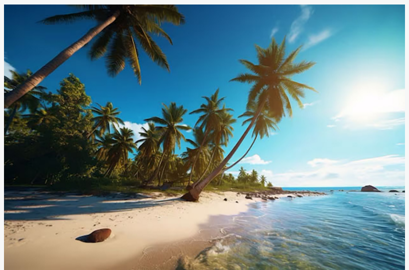
Palms on the beach