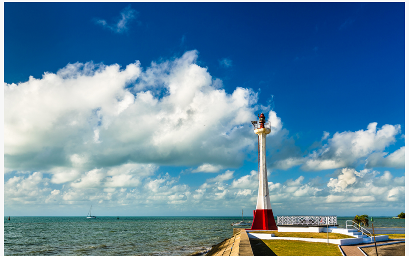
Baron Bliss Lighthouse