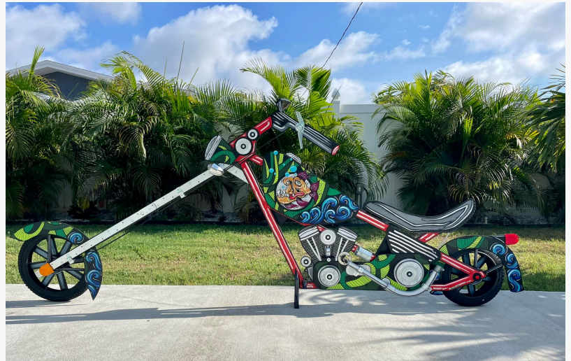
Wooden Handmade Chopper Motorcycle

This press release can be viewed online at: https://www.einpresswire.com/article/653952677