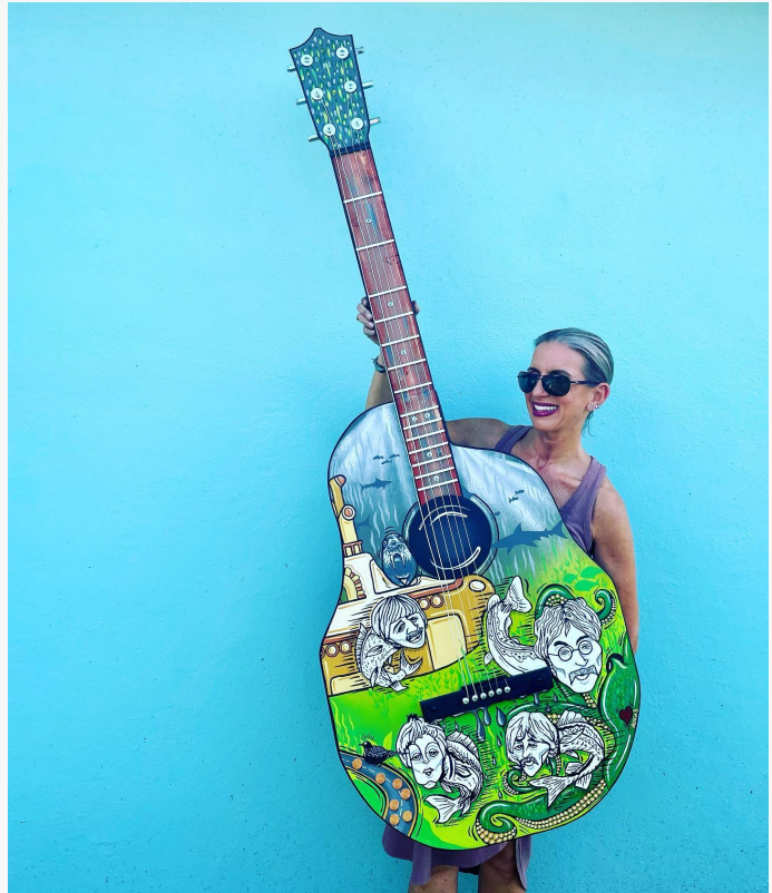
Wooden Beatles Guitar Handmade