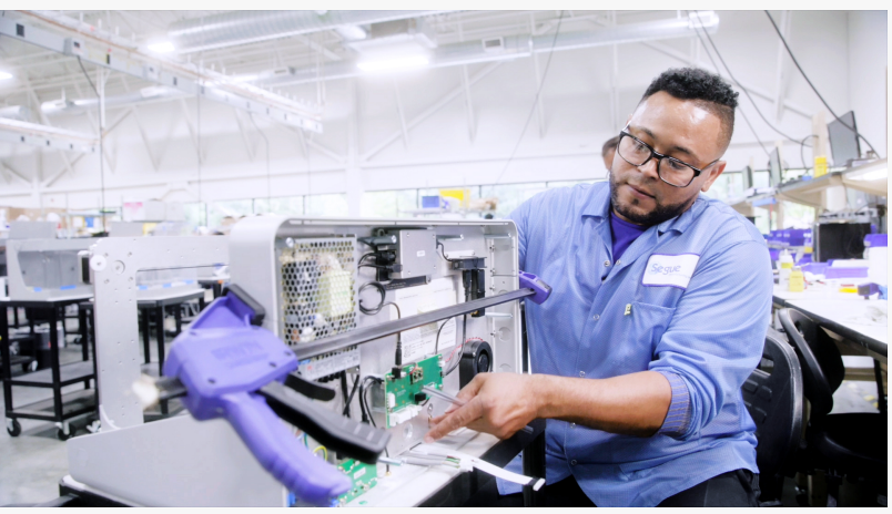
Segue Manufacturing - Robotics and Electromechanical Expertise

Segue Manufacturing - Lorom - In-Tech Electronics Global Operations