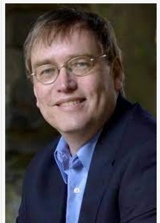
William R. Forstchen is widely considered one of the foremost experts on EMP attacks.

Pulled back into the fray, John struggles to hold the tottering Republic together. Facing threats on multiple fronts, he races against time to stop another EMP attack on the former United States and China, putting years of progress at risk. With so much of his work under threat, John must find the strength within to start over, so that he can save the country and the people that he holds dear from even greater calamity.