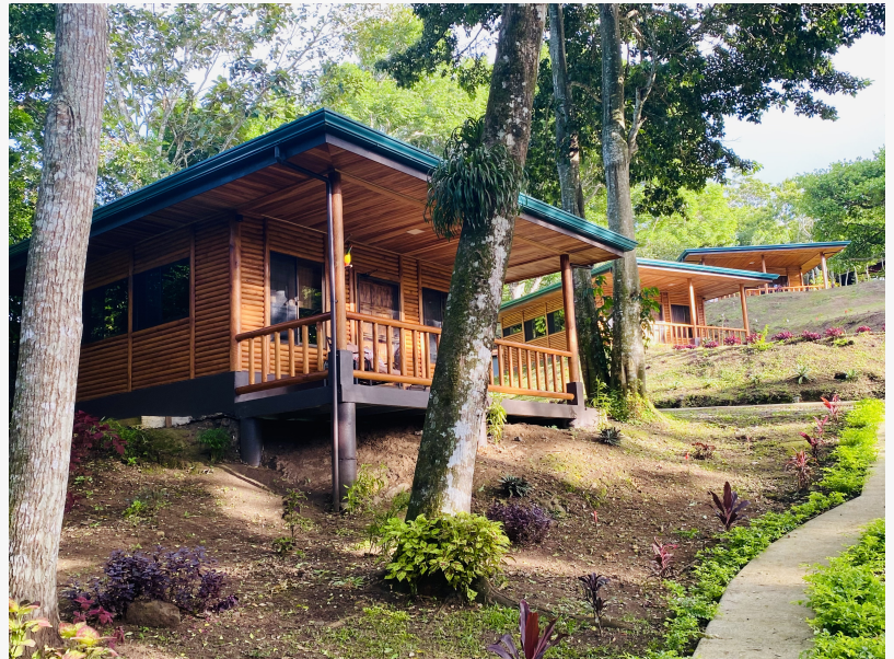
Cabañas Koi Retreat