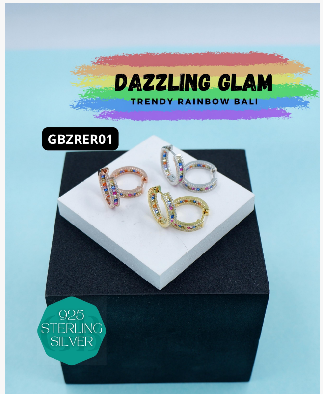
GlamBug Mart Private Limited