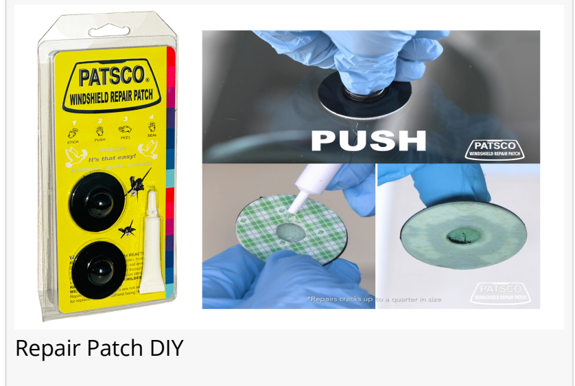
Repair Patch DIY

Versatile: Suitable for a wide range of windshield damage, from small chips to larger cracks, the Patsco Windshield Repair Patch is a versatile solution.