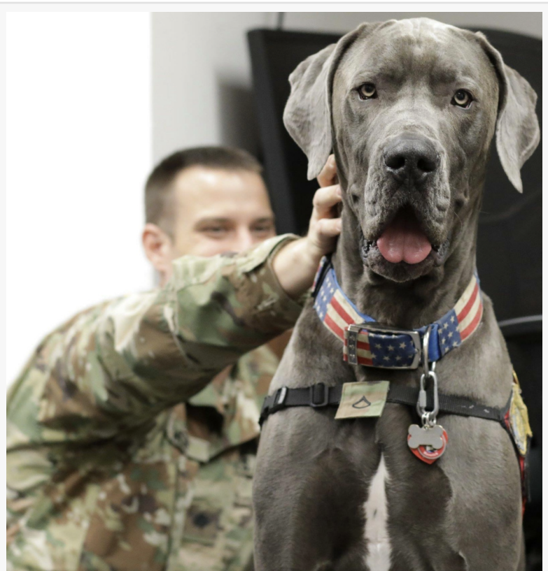
Therapy Dog Maverick

White, Ariel Winter, Vivica A. Fox, Rebecca Romijn, Alison Sweeney, James Denton, Beth Stern, Faithe Herman, Marcus Scribner, Bindi Irwin, Derek Hough, Richard Marx, Katharine McPhee,