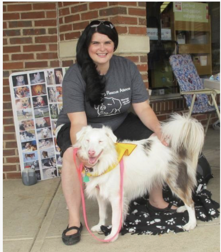
Emerging Hero Shelter Dog Raina