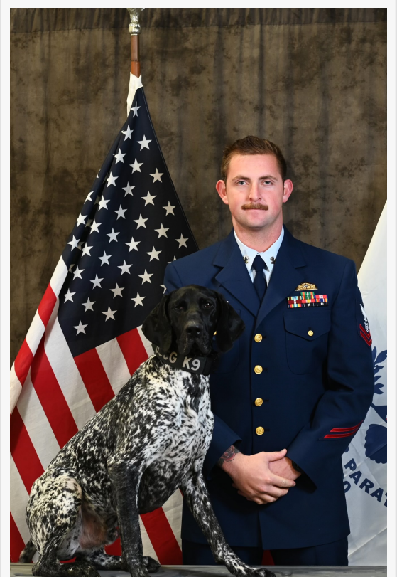
Military Working Dog Buda