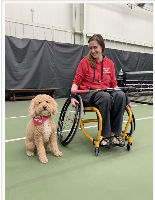
Service Dog Moxie

Buda (Oceanside, California): Military working dog Buda—a four-year-old German shorthaired pointer—bravely serves our country as one of only eighteen certified explosives-detection