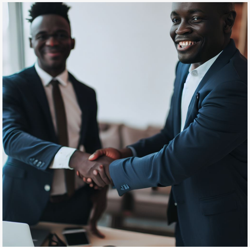
Amicus International Second Passport

2.Educational Opportunities: With a second passport, students can access international educational opportunities with fewer bureaucratic hurdles. Whether it's a short-term course, a full degree program, or even a research grant, the world becomes an oyster of knowledge.