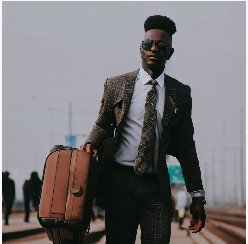
Amicus International, your best option when you need a Second Passport

Increased Visa-Free Travel: The primary benefit of obtaining a second passport is the increased access it offers. Many countries, such as those in the European Union or the Caribbean, provide their passport holders with visa-free or visa-on-arrival entry to over 100 countries, vastly