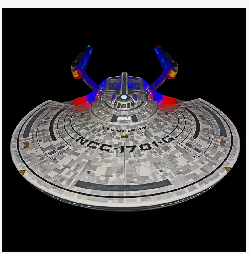
FE Masterworks U.S.S. Enterprise NCC-1701-G / U.S.S. Titan