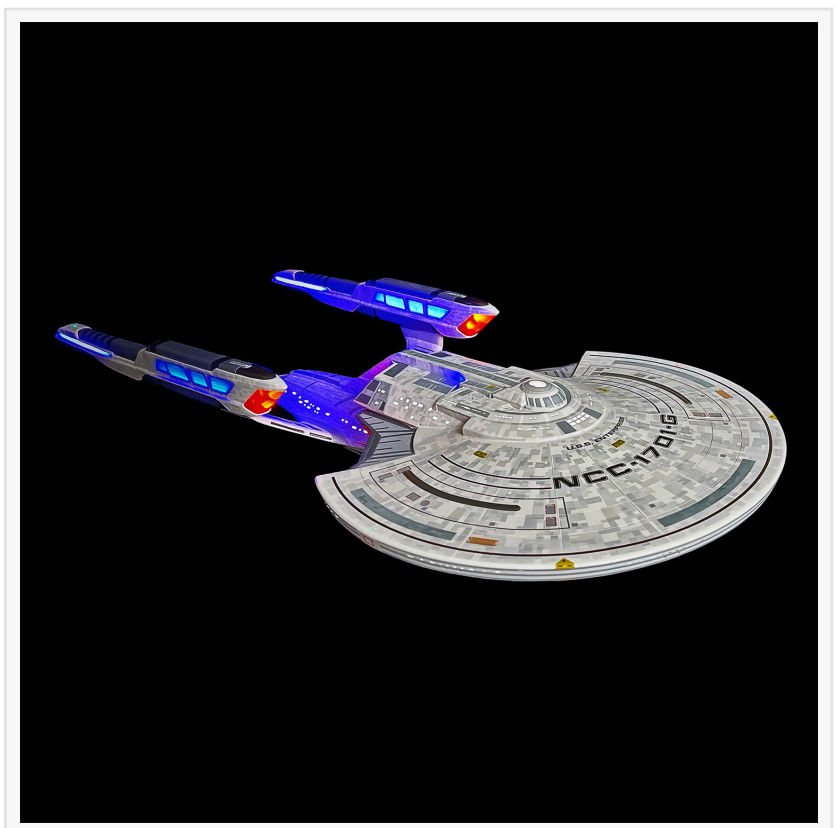
FE Masterworks U.S.S. Enterprise NCC-1701-G / U.S.S. Titan

Paramount Consumer Products oversees all licensing and merchandising for Paramount (Nasdaq: PARA, PARAA), a leading