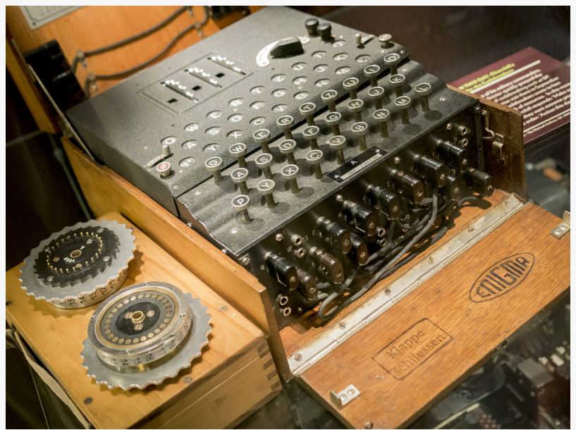
ResumeBlaze Introduces a State-of-the-Art Free Password Generator

/EINPresswire.com/ -- ResumeBlaze, a recognized leader in the job-seeking sector, has expanded its digital suite by launching a cutting-edge password generator, free for users worldwide. As cybersecurity threats continue to proliferate, the significance of robust passwords has never been more pertinent. ResumeBlaze's innovative tool was crafted with the essence of online security in mind.