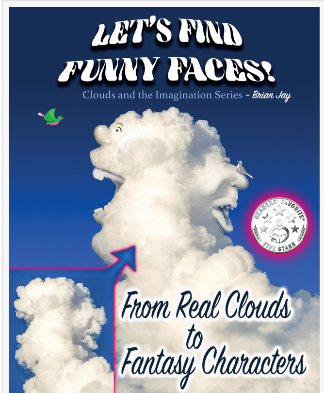
Front Page of Let's Find Funny Faces!

For more information about Let's Find Funny Faces! or Brian Jay: