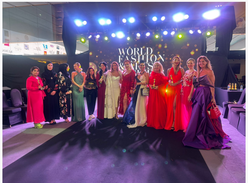
Some of the VIPs in the fashion show