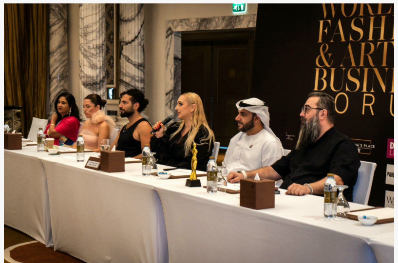
Press conference at the World Fashion & Arts Business Forum