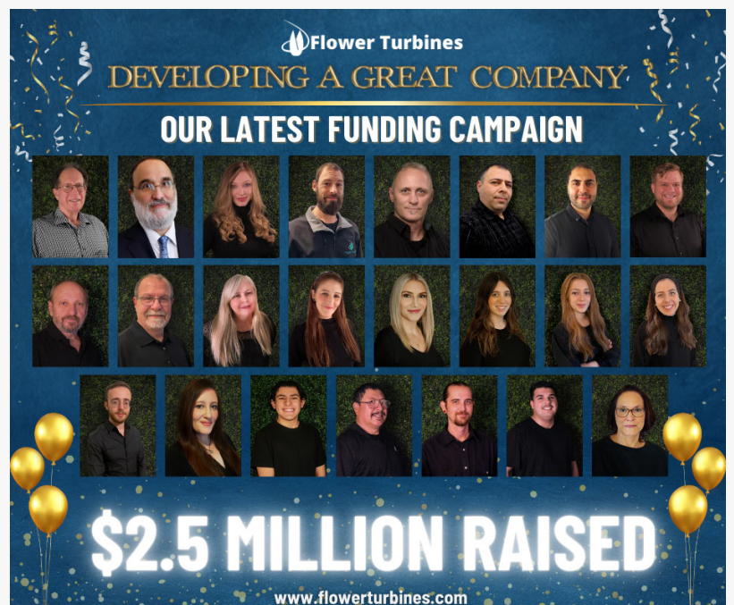
Flower Turbines Is Building a Great Company

Those in the EU can buy by quotation from their staff at support.eu@flowerturbines.com