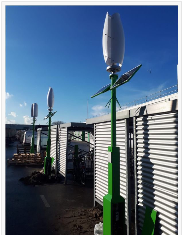
Wind and Solar E-bike Charging Poles

This press release can be viewed online at: https://www.einpresswire.com/article/654539383