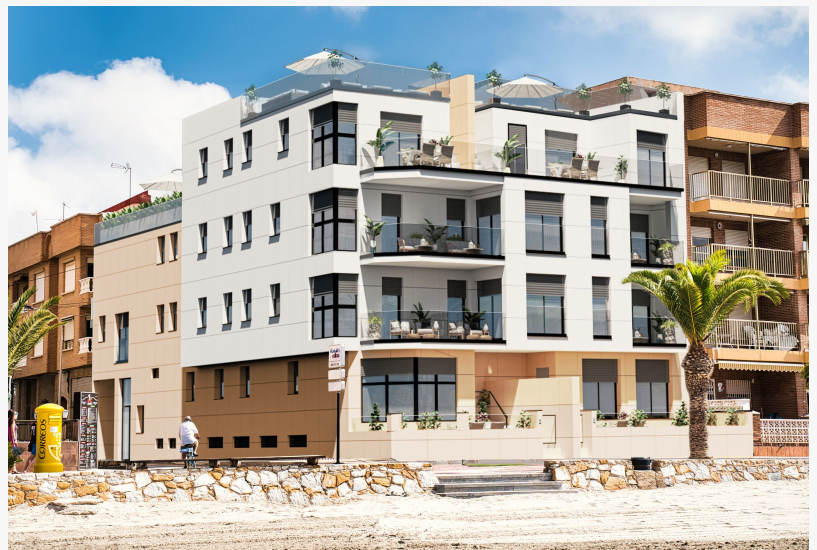
J&B Invest Spain luna2

This press release can be viewed online at: https://www.einpresswire.com/article/654556982