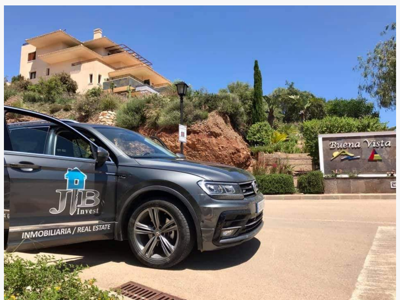
J&B Invest Spain Auto