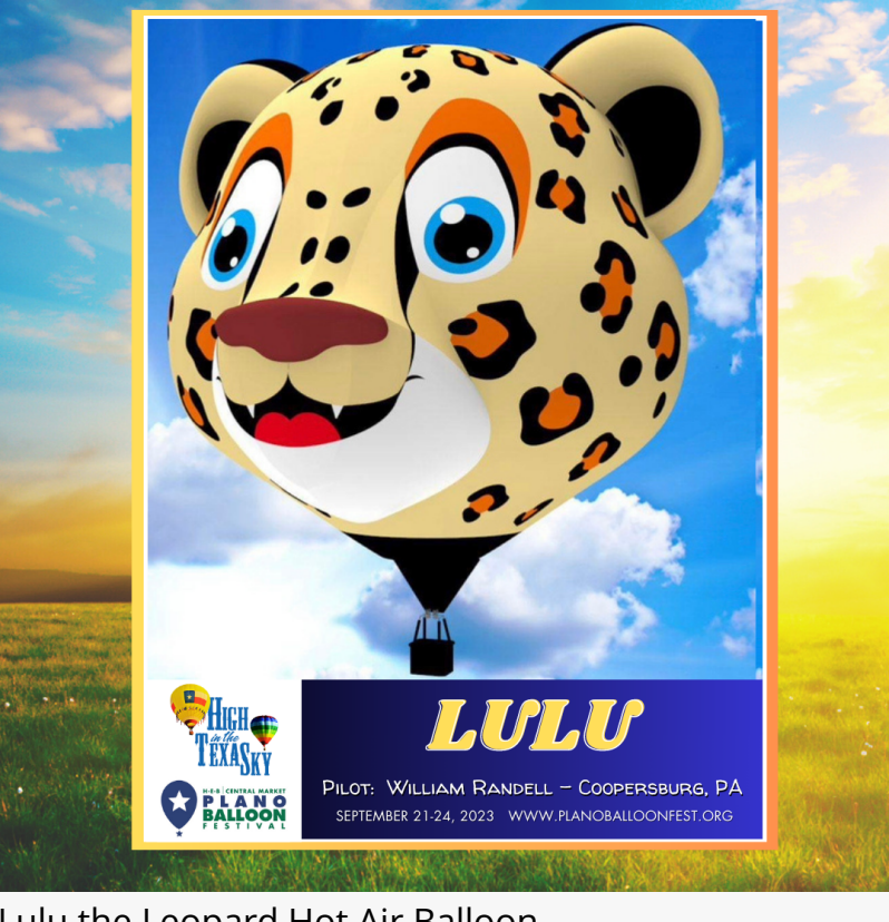
Lulu the Leopard Hot Air Balloon

High In the Texas Sky 2023 H-E-B | Central Market Plano Balloon Festival