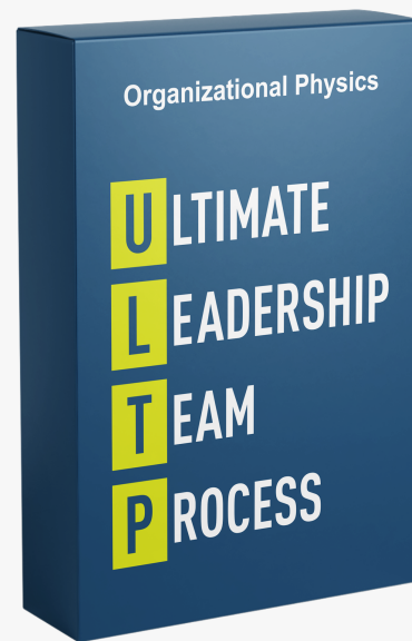
The Ultimate Leadership Team Process (ULTP)