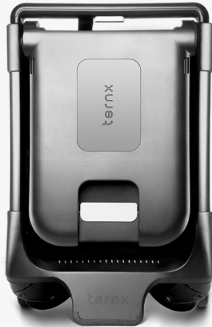
TernX Carry On Luggage

In the last 12 months, TernX Carry On has also been named by TIME magazine as a best invention of the year and have won numerous innovation & design awards including, Good Design Award, German Design Award and two Pause Awards as one of Australia's most ambitious and forward-thinking companies.