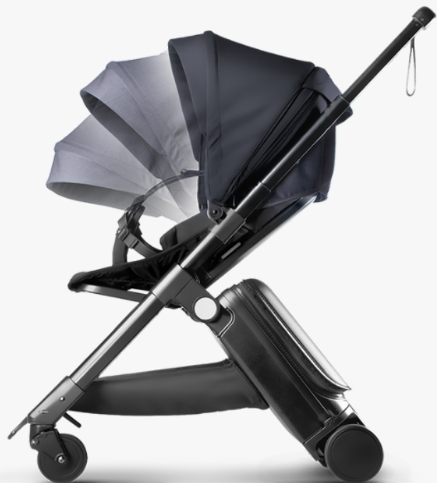
TernX Carry On Stroller