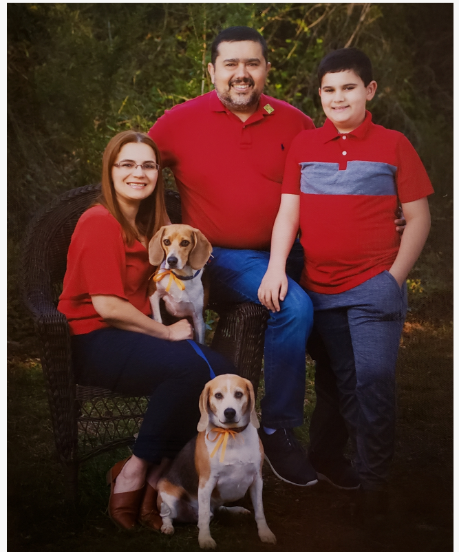
Alencar Family Foundation Team

In a world where compassion and generosity can transform lives, the Alencar Family Foundation shines as a beacon of hope and change. For 4 years, this nonprofit organization has been at the forefront of supporting charitable causes, making an indelible impact on individuals, communities, and society at large. Today, we celebrate the Alencar Family Foundation's unwavering commitment to philanthropy and their vital role in promoting the significance of charitable work and volunteering. The foundation motto is BE THE GOOD . Be the reason people still believe there is good in this world.