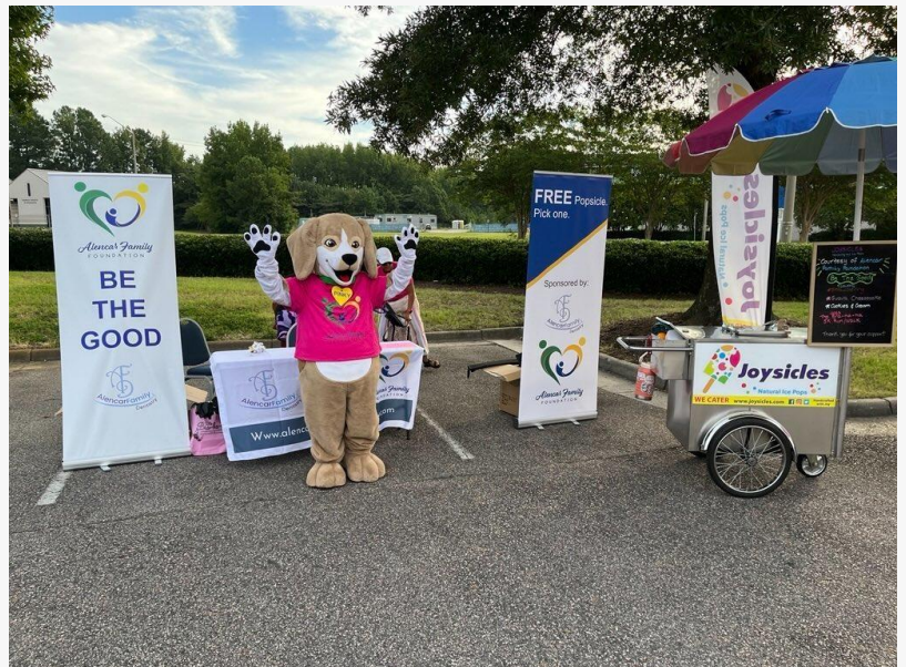
Brahaha 5k 2023