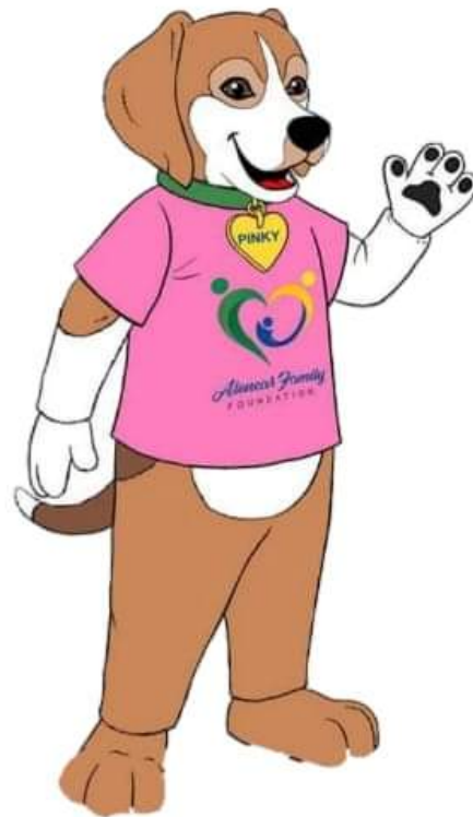
Pinky the mascot

The Alencar Family Foundation's commitment to positive change is evident through a diverse array of initiatives that touch the lives of those in need. These initiatives are driven by a holistic