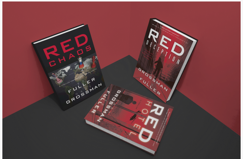
Red Hotel Series - 3 Books