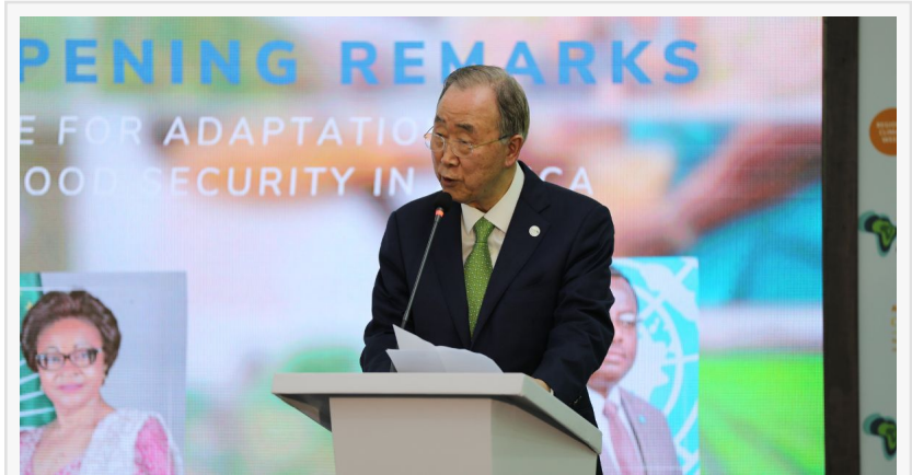
Ban Ki-moon Centre Co-chair Ban Ki-moon on stage during the high-level side event at the Africa Climate Summit.

About Ban Ki-moon Centre for Global Citizens