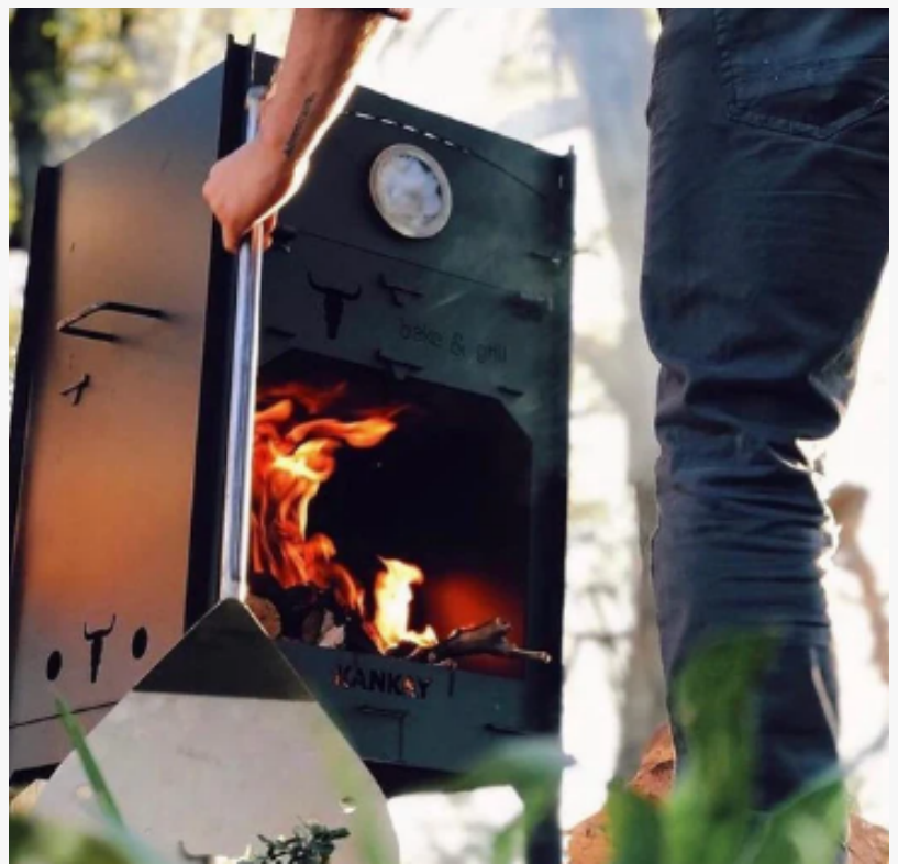
Kankay's Selection of Outdoor Grills