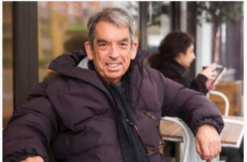
Author Jimmy Burns