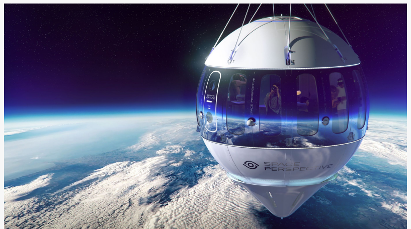
Space Perspective's Spaceship Neptune Capsule

environmentally friendly, sustainable travel with Space Perspective's carbon-neutral space travel option.