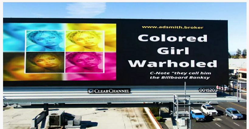
"LOOK UP!" 2, HOPE & BEAUTY, a billboard art exhibition featuring "Color Girl Warholed," an artwork by C-Note.

This press release can be viewed online at: https://www.einpresswire.com/article/655186545