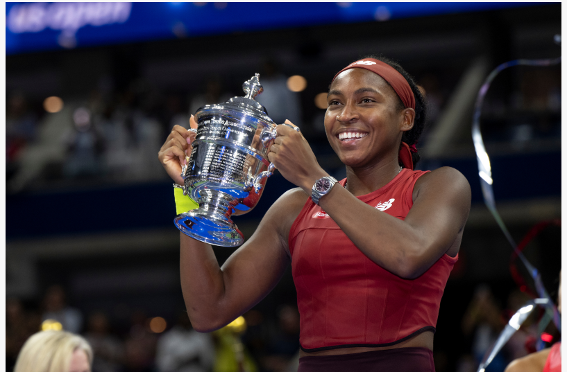
ROLEX TESTIMONEE COCO GAUFF LIFTS THE TROPHY AT THE US OPEN 2023

strengthening the Swiss watchmaker's presence at the heart of the game with the support of all four Grand Slam tournaments. As part of its pivotal partnerships in sport, the brand helps to