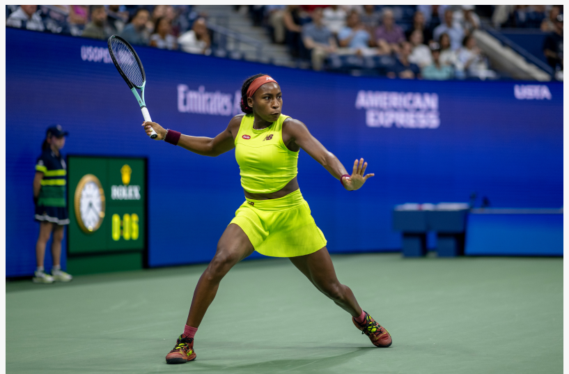
ROLEX TESTIMONEE COCO GAUFF PREPARES TO HIT A FOREHAND AT THE US OPEN 2023