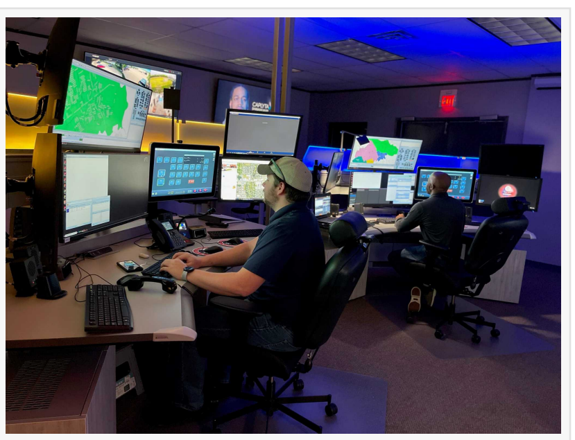
Texas Emergency Communications Center is located in Spring, Texas

Texas ECC also serves as a Secondary Public Safety Answering Point (PSAP) within the Greater Harris County 9-1-1 Emergency Network, which oversees the administration of the 9-1-1 emergency communications and technology infrastructure for Harris and Fort Bend Counties.