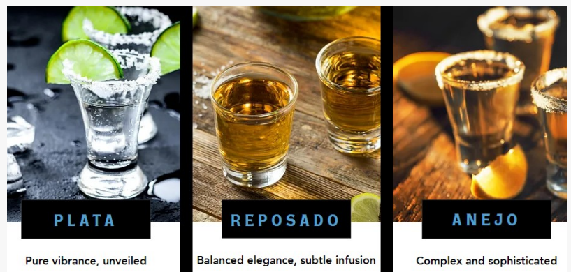
Dio Azul Tequila Varieties $WTII