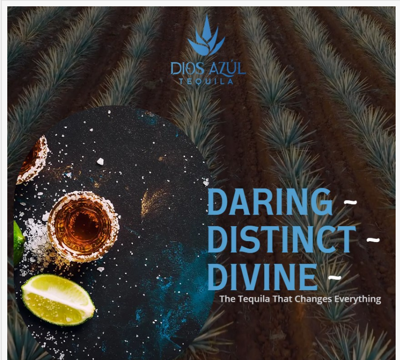
Dio Azul Tequila $WTII

WTII Signs Letter of Intent to Acquire Dios Azul a Premium Tequila Brand