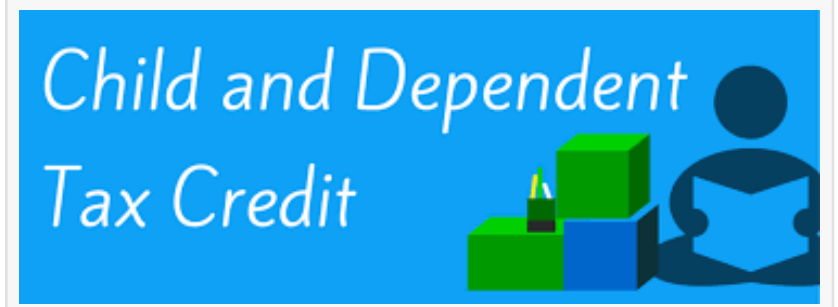
Dependent Child Tax Credit

Digital Innovations: The IRS is investing in modernizing its systems, making it easier for taxpayers to file returns electronically and receive refunds more quickly. Embracing digital tools and e-filing options can streamline the tax return process.