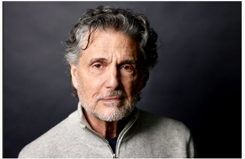
Chris Sarandon.

Fans and food enthusiasts can tune in to 'Cooking By Heart' on major podcast platforms like Apple Podcasts, Spotify, and Google Podcasts, as well as on YouTube. The show's winning combination of celebrity charisma, heartfelt storytelling, and mouthwatering recipes has already earned it a dedicated following, ranking in the top 5% of all podcasts globally, according to Listen Notes. Season 2 promises even more unforgettable moments.