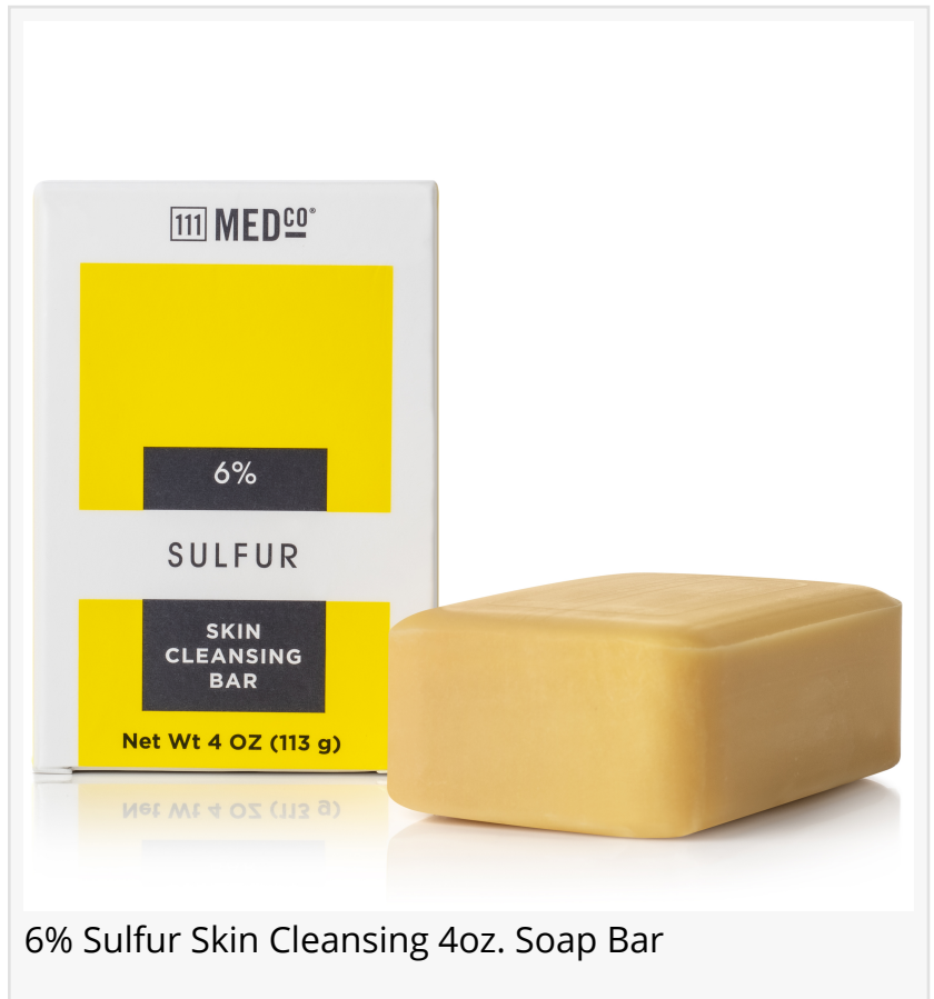
6% Sulfur Skin Cleansing 4oz. Soap Bar

111MedCo has become one of the fastest growing skincare companies. They continue to focus on soap bars to deliver tried and true active ingredients. Bar soaps get you clean, reduce waste, and may last longer. They are also making a resurgence due to their simplicity of packaging, only requiring paper and no plastic. They are also lighter to transport than liquid soaps helping to reduce environmental impacts.