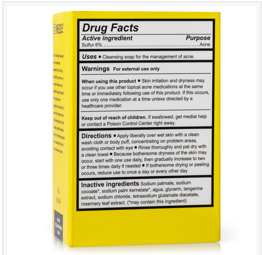
6% Sulfur Drug Facts Label

Enzo Marchand RPh 111MedCo LLC +1 888-711-7090 info@111MedCo.com