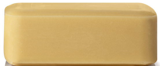
6% Sulfur Made in USA