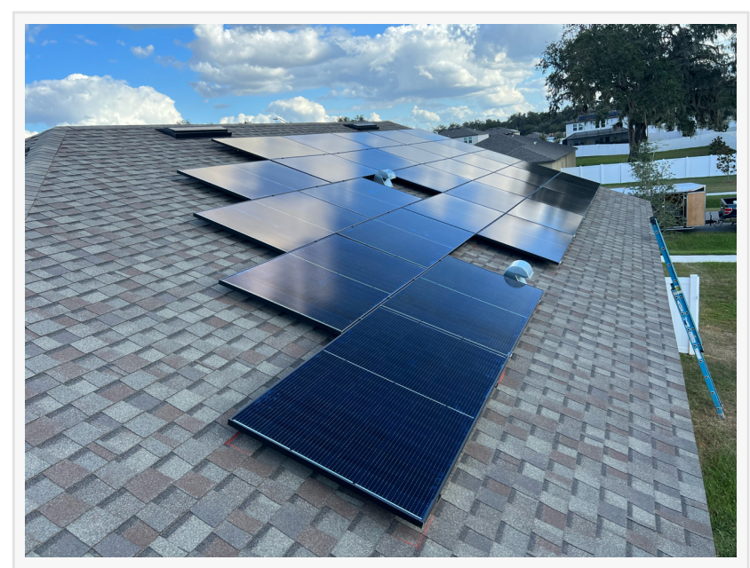
Evergreen Solar Panels on Roof

Evergreen Solar Solutions has a leadership team that leverages their many years of experience in the hospitality industry to offer unparalleled customer service and satisfaction using proven best