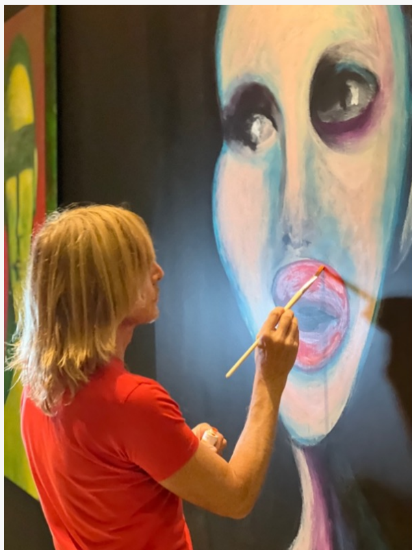
Marc Bower Painting Lip Situation (acrylic on canvas)