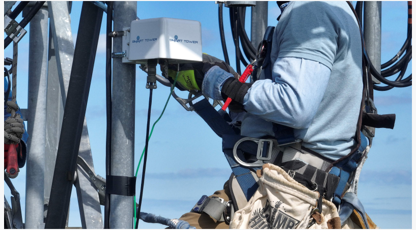
FDH Smart Tower Install on 290ft CTI Cell Tower

For this installation and many to follow, Smart Tower leverages analytical data to provide asset owners with informed insights. This intelligent, data-informed approach enables smarter decision-making to reduce repair and maintenance costs and maximize structural asset investments.