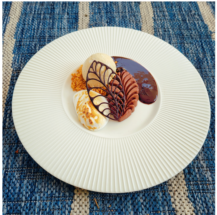
368 Maine S'mores

This press release can be viewed online at: https://www.einpresswire.com/article/655333892