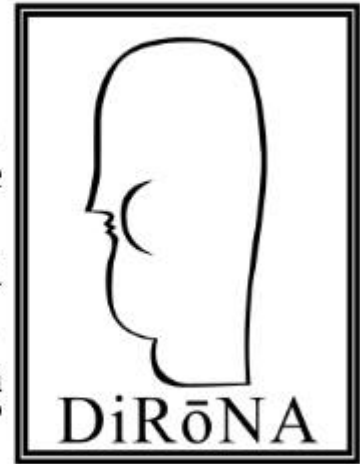
Distinctive Restaurants of North America logo

The Award of Excellence Distinguished Restaurants of North America Since 1990