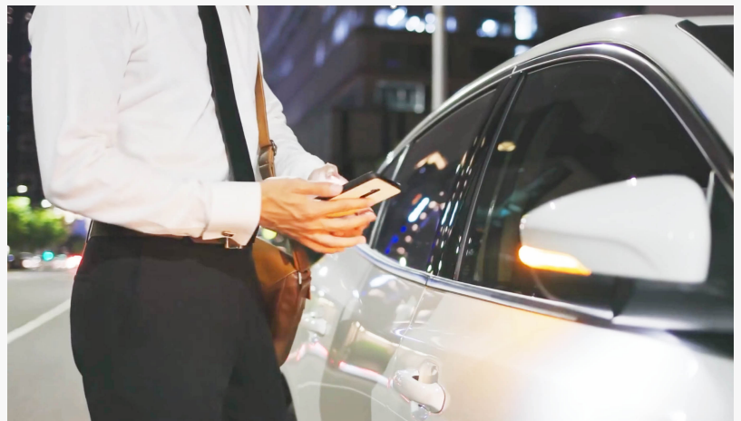
ORCODA RENTAL CONNECT - keyless entry to multiple car manufacturers