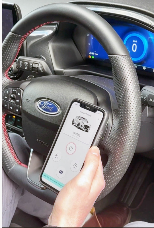
ORCODA RENTAL CONNECT - one app to book, pay, locate, open and start a vehicle