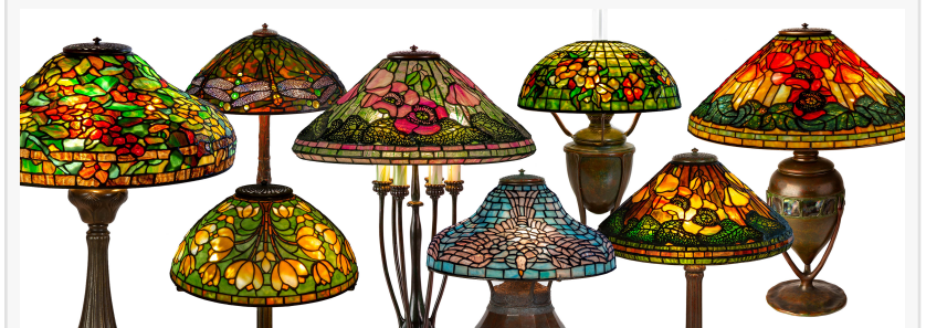
The auction features a fine selection of Tiffany lamps.