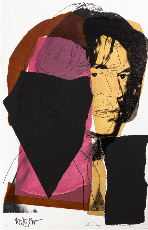
Screen-print by Andy Warhol (American, 1928-1987) of Rolling Stones frontman Mick Jagger (F. & S. II.139). (est. $50,000-$80,000).

The lamps and lighting category will be led by lamps and accessories from Tiffany Studios, to include a lovely Nasturtium table lamp with 18-inch shade (est. $50,000-$80,000); a dichroic "jeweled" Dragonfly" lamp with "pony tree trunk" base