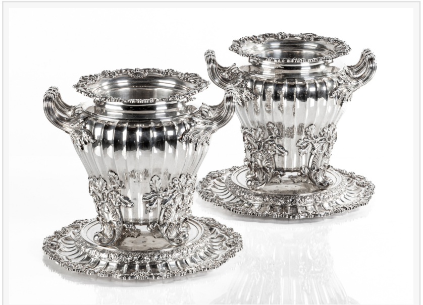
Pair of fine and rare George III silver wine coolers, liners and stands carrying the mark of Paul Storr, London, 1819 (est. $50,000-$80,000).

An impressive array of fine silver including important works by Georg Jensen and Paul Storr , lamps and accessories by Tiffany Studios , postmodern artworks by Andy Warhol and Keith Haring, and other fine and decorative arts, will be offered. The full catalog, complete with photos and detailed descriptions, can be viewed at cottoneauctions.com .