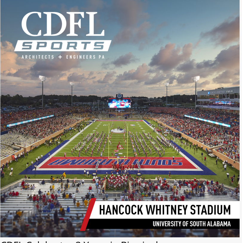
CDFL Celebrates 3 Years in Birmingham

MS, and Birmingham, AL, our unique collaborative approach brings together a wide range of talents on every project. Throughout our 60+ year history, CDFL has celebrated ideas and the