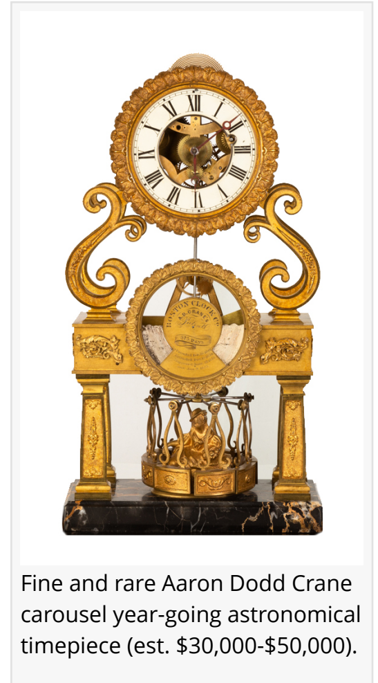
Fine and rare Aaron Dodd Crane carousel year-going astronomical timepiece (est. $30,000-$50,000).