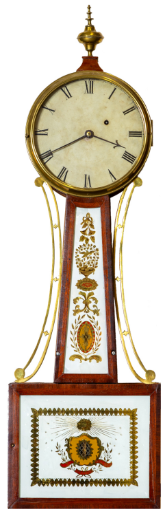
Rare Simon Willard banjo clock (est. $10,000-$15,000).

This press release can be viewed online at: https://www.einpresswire.com/article/655511017