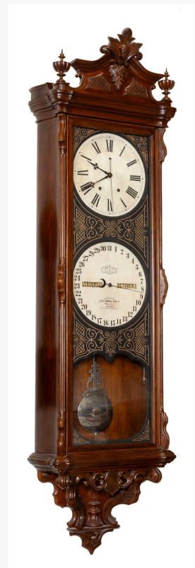
Ithaca No. 1 regulator (est. $15,000-$25,000).