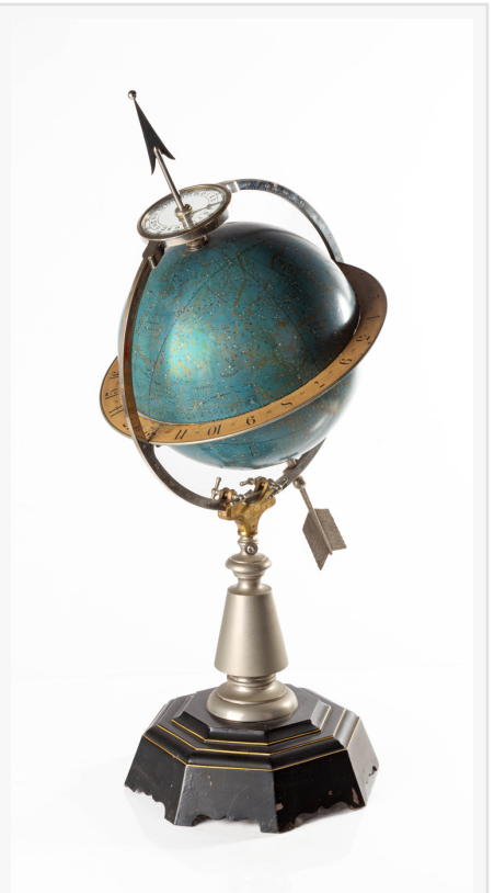
Fine and rare Juvet celestial time globe (est. $15,000-$25,000).