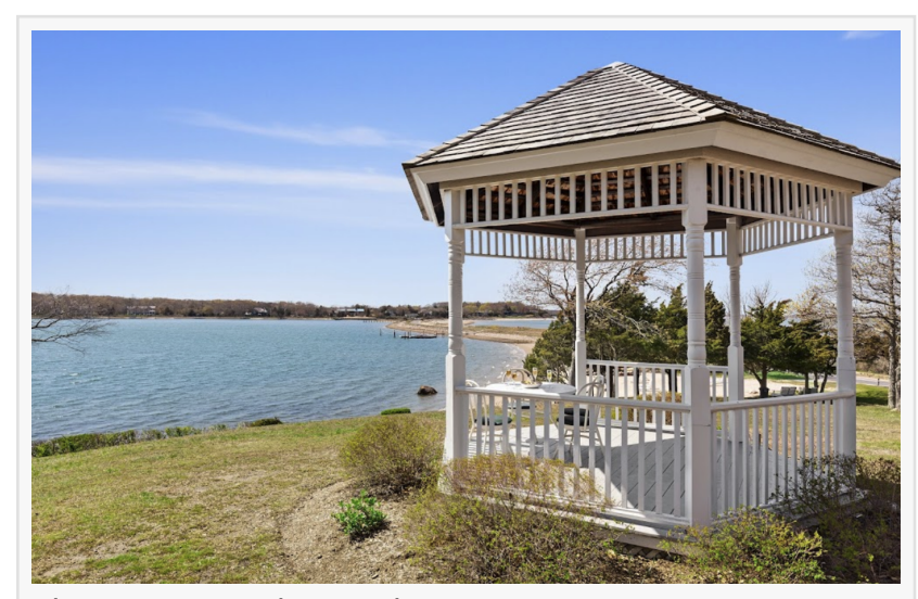
The Rams Head Outside

Experience the opportunity to walk the very corridors where Oppenheimer rubbed shoulders and exchanged ideas with the scientific luminaries of the day. The Rams Head Inn, site of the first Shelter Island Conference on the Foundations of Quantum Mechanics after World War II, is still open and operating – you can even stay the night.