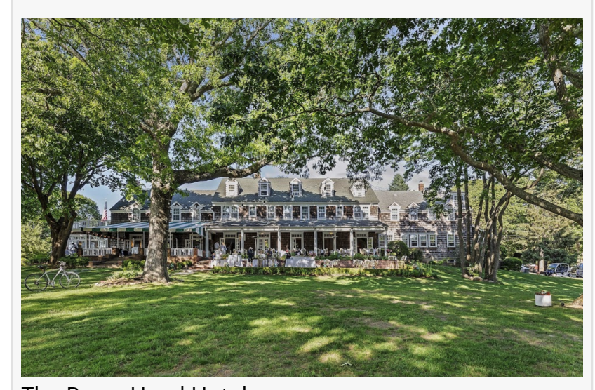
The Rams Head Hotel

As the film shows, in many ways, the scientists behind the atomic bomb didn't fully comprehend the impact of its world-changing power until its first and only use in a real war. It was an eye-opening moment for physicists around the world, realizing how the pursuit of scientific breakthroughs could be the cause of mass devastation. This sparked the first Shelter Island Conference, which focused on promoting the free scientific collaboration that had been impossible during the war.