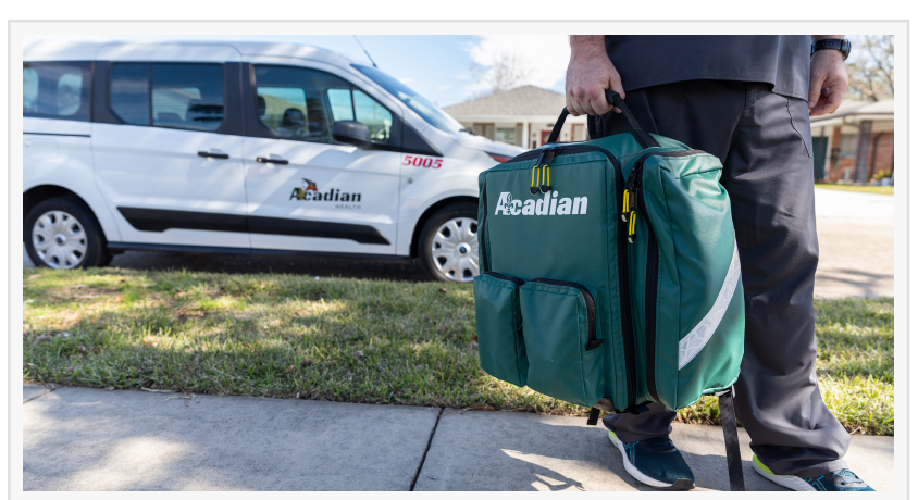
Acadian Health has provided services in Louisiana for the past 10 years, has the framework and the assets needed to grow into major markets in Texas, and is poised for nationwide opportunities.

LAFAYETTE, LOUISIANA, UNITED STATES, September 14, 2023 /EINPresswire.com/ -- <u>Acadian Health</u>, a division of <u>Acadian Companies</u>, has expanded its healthcare services to key Texas markets, including Austin, Beaumont, Dallas, Fort Worth, Houston, and San Antonio. This strategic expansion positions Acadian Health to spearhead unparalleled advancements in medical care,