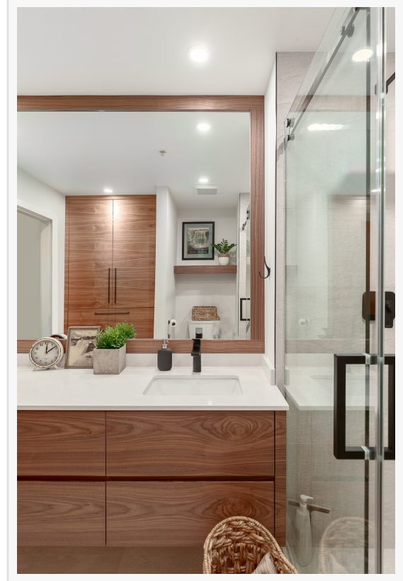
Bathroom Remodeling job in North Vancouver

For anyone dreaming of a custom renovation that mirrors their personal style and is built to last, there's no better partner than Canadian Home Style. As always, the company remains dedicated to the principle that every customer "deserves nothing but the very best."