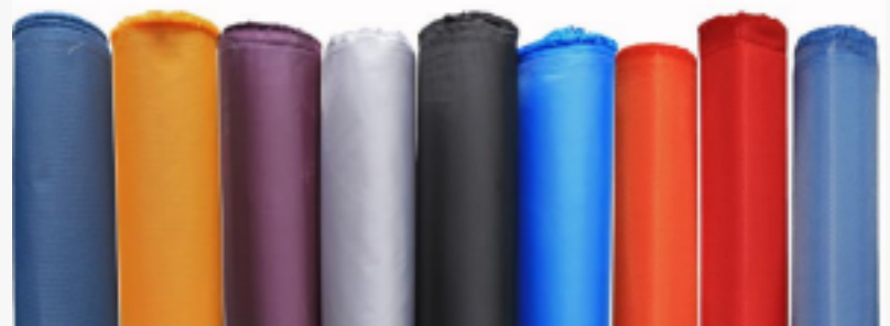
Nonwoven fiber rolls