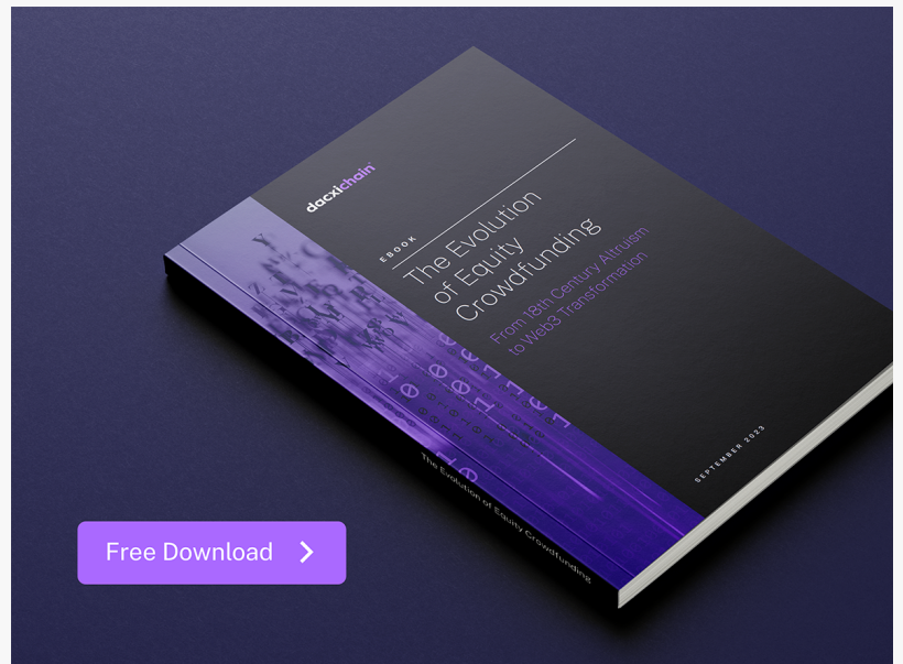
The Evolution of Equity Crowdfunding: From 18th Century Altruism to Web3 Transformation.

A rich historical resource, the eBook takes readers on an intriguing journey through the development of equity crowdfunding. It charts the industry's humble roots in 18th Century Ireland, its meteoric rise in the 2000s, and its thrilling Web 3.0-led future.