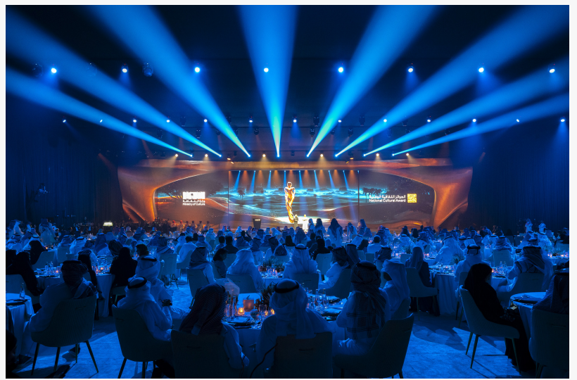
National Cultural Awards Event

Under the patronage of His Royal Highness Prince Mohammed bin Salman bin Abdulaziz Al Saud, Crown Prince and Prime Minister of Saudi Arabia, the National Cultural Awards were presented in 16 categories, which encompassed a diverse range of honors including a Cultural Pioneer Award, Youth Cultural Award, International Cultural Excellence Award, Business Owners Award and a Cultural Institution Awards; as well as sector-specific awards for achievements in film, fashion, music, literature and other cultural sectors.