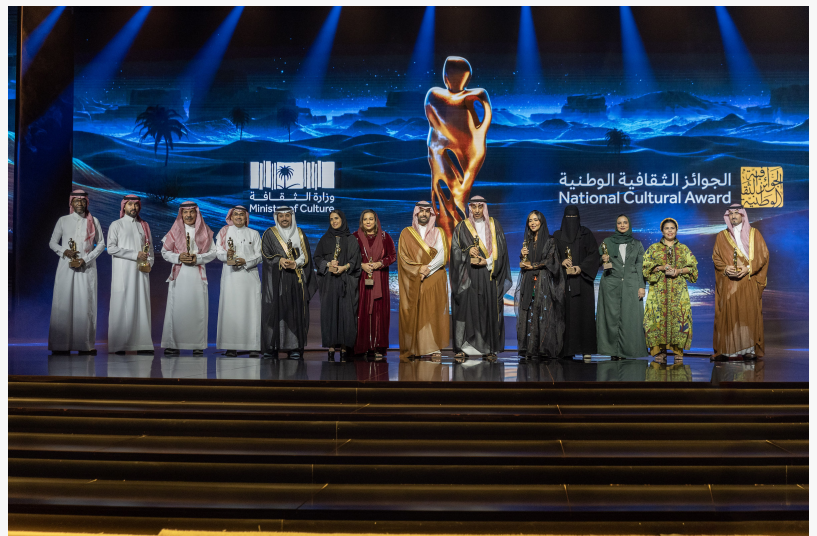
National Cultural Awards Winners on Stage