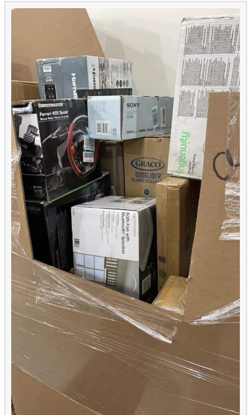
amazon truckload returns pic1

For small businesses and retailers, this initiative is nothing short of a boon. By partaking in