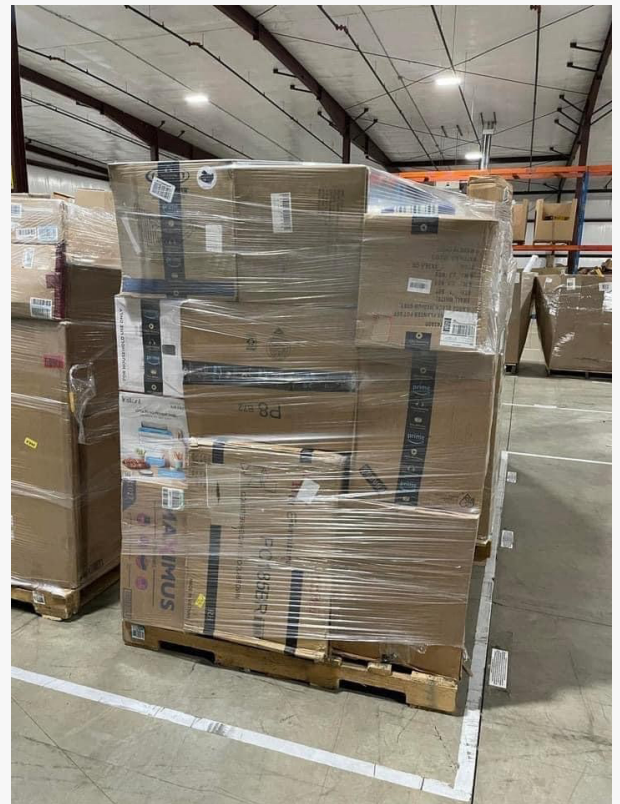
how to buy amazon truckload liquidation pic3