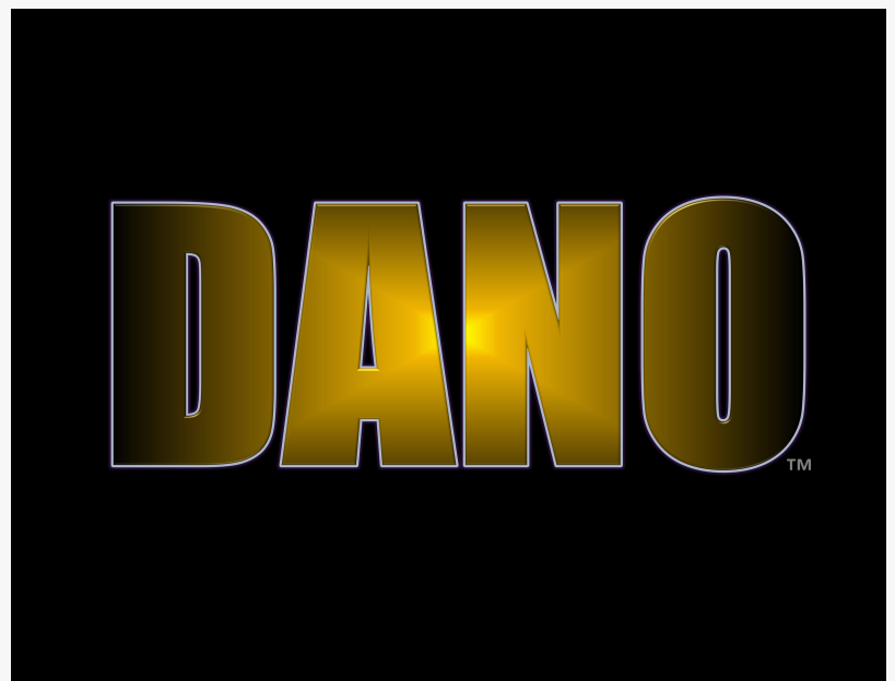
The free streaming tv platform created by filmmakers.