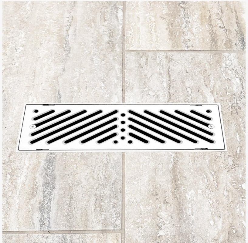
Breeze Flush Mount Metal Floor Register